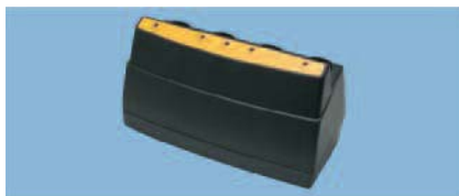
Multi Battery Charger, MC-8000