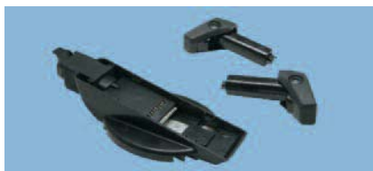
Spare Battery Slot, SBS-8000 Removable Battery Pack, RBP-8000