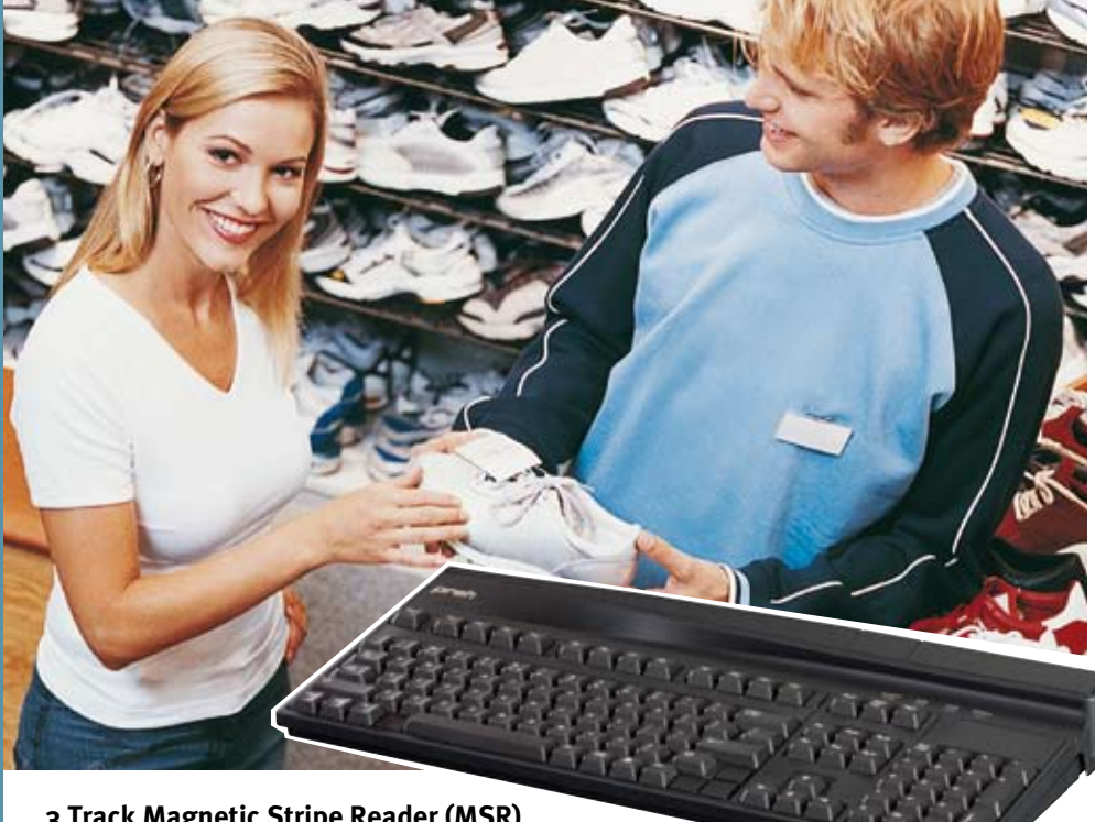
3 Track Magnetic Stripe Reader (MSR)