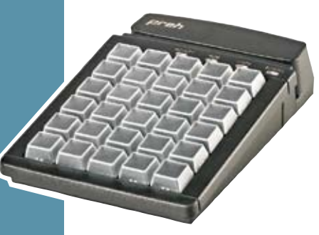
MCI 30 with MSR