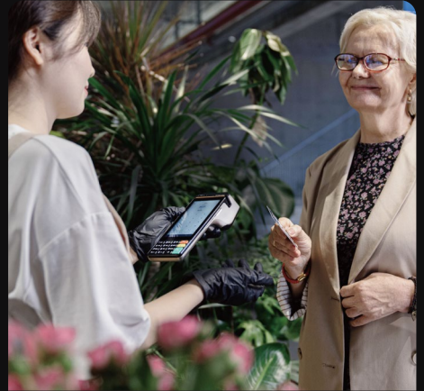
Designed for the Visually Impaired

*The above scenarios apply to P3/P3KH/P3H.