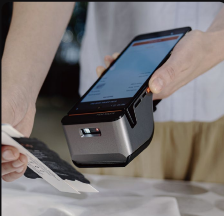
Retail Inventory Counting & Checkout